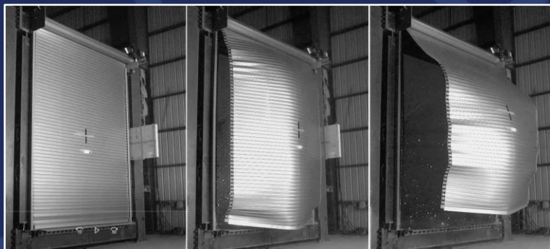
High-speed camera images of PL1 test

PL1 (without bottom restraints) has been tested and shown to be capable of achieving limited damage in response to a blast load with peak pressure 75 kPa and peak impulse 1050 kPa-ms; and