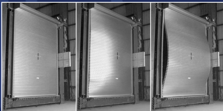
High-speed camera images of PL2 test

PL2 is fitted with a pair of automated bottom restraint device that will work with the motor operator to ensure that the restraints will always engage whenever the shutter is in the closed position. PL2 has been tested and shown to be capable of achieving limited damage and be fully retained in response to a blast load with a peak pressure 40 kPa and peak impulse 500 kPa-ms.