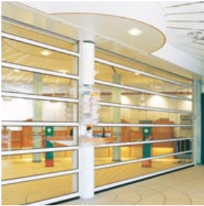
Mobile partition walls